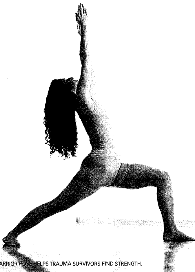
WARRIOR POSE HELPS TRAUMA SURVIVORS FIND STRENGTH.

This painful reliving of events is a common symptom of PTSD, a chronic anxiety disorder that can develop after someone is involved in a traumatic event, whether it's a sexual or physical assault, a war, a natural disaster, or even a car accident. Existing treatments—which include group and individual therapy and drugs such as Prozac—work only for some patients.